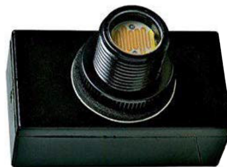
Model CCR-PHC-0306-GC (Button Type Photocell)